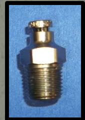
4352 Mini Fitting