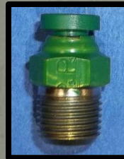
4351M 4mm Fitting